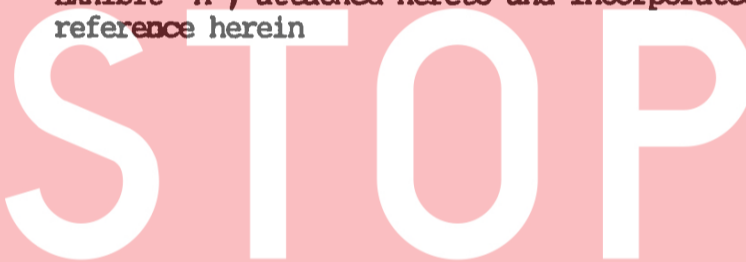
Exhibit "A", attached hereto and incorporated by reference herein

The property is located in Lake County ..... at ..... (County) ..... 2725 Lincoln St ..... Highland ..... Indiana ..... 46322 ..... (Address) (City) (ZIP Code)